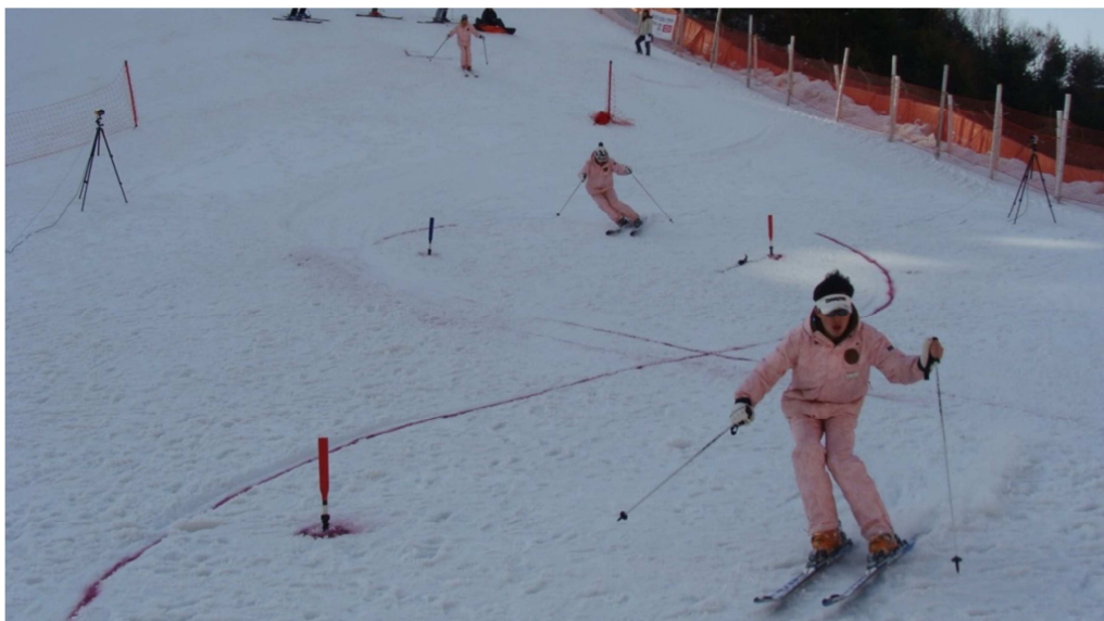
Figure 2. Subjects set up on ski slope

turn was 21.55 m. Both left and right turns were attempted. Then, the data from the start to the end of the left turn (second turn) were processed (Figure 2).