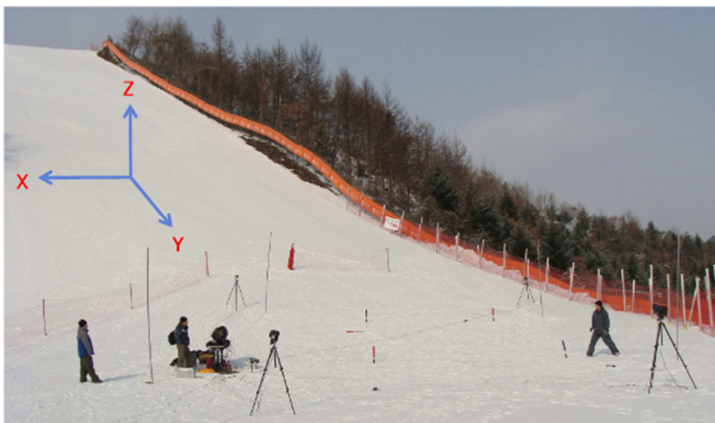
Figure 1. Experiment environment